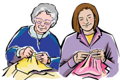
Knitters & Crocheters

We are hoping to see you on Saturday, March 5.