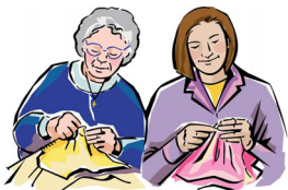
Knitters & Crocheters