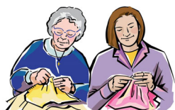
Knitters & Crocheters

Would you like to learn how to knit/crochet? Or just need help to revive your skills? Consider meeting with the group on Wednesdays, September 14 and 28 at 10am in the Fellowship Hall. We are making hats/caps for residents at Lila Doyle in September. We make our own items, but our main goal is to reach out to our congregation, community and nationally for those in need for caps, scarves, afghans, etc.